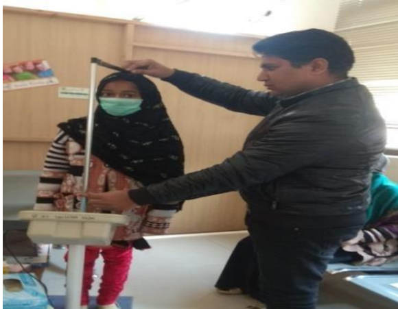
Fig. 1 Stature estimation by Frankfort plane

For the measurement of hand length Fig.2, the distance between the midpoint of distal transverse crease of wrist to most anterior skin projection of middle finger was recorded (Ishak et al. 2012). Hand breadth Fig.3 was reported by measuring the distance between the most metacarpal up to the most medial point on hand of fifth metacarpal (Oshak et al. 2012).