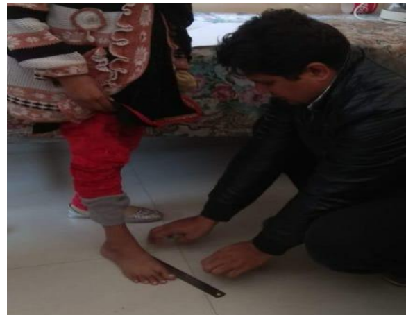
Fig.5 Estimation of foot length