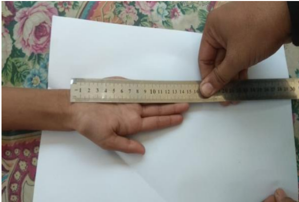
Fig. 2 Hand length estimation of healthy individual