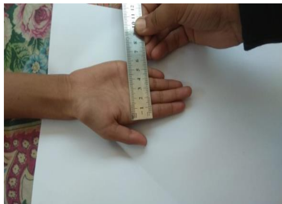
Fig. 3 Hand breadth estimation of healthy individual