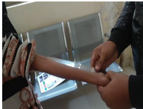
Fig.6 Estimation of forearm length