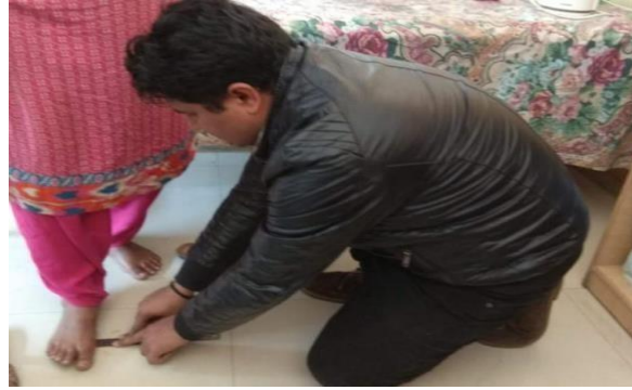
Fig.4 Estimation of foot breadth