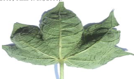
Fig 1. Curling upward along with the thickening of cotton plant leaves.

The cotton leaf curl virus disease (CLCuD) is one of the serious diseases of cotton, which caused damage in cotton production. The indications are including thickening and yellowing about little veins on the down surface of leaf with shrunked margins. Margins twist descending alternately upward with hindered plant growth under disease attack because of decreased inter-nodal separation (Qazi et al. , 2007; Zhou, 2013). Flowering, boll development, maturation, seed cotton generation and fiber quality are extremely effected (Amrao et al. , 2010). CLCuD reveals to upward twisting (Fig. 1) alongside thickening of the cotton plant leaves, twisting alongside leaf thickening, enations on the underside of the leaves, and cotton plant hindering growth. Transgenic cotton expressing partial AC1 and \beta C1 gene of CLCuV can be used as virus resistance source in cotton breeding programs aiming to improve yield and potential of cotton (Sattar et al. , 2013; Tahir et al. , 2011).