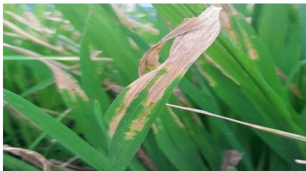
Figure 1. Symptoms in rice of bacterial leaf blight.

Bacterial blight disease caused tannic-grey with white lesions along the veins of leaves of plants. In the tillering stage (Fig. 1), the stricks expands with plant growth, peaking at up to the blooming stage of plant. The additional harming show fate of the disease is Kresek, wherein those abandons of the entire plant transform pale yellow and shrivel of the early tillering phase throughout the seedling, bringing about an incomplete or totally finish crop yield (Ronald et al. , 1992; Yang et al. , 2006). Same time in the least development stages, leaf bud occurs, in spite of the fact that when kresek proceeds, harmful effect became extensive, post-flowering infections bring next to no sway for grain yield. The Xa1 gene which has been identified and transform in rice confers a resistance to Japanese race 1 of Xanthomonas oryzae pv. oryzae , against causal pathogen of disease bacterial blight (BB). One of the BB-resistance genes, Xa1, confers a high level of specific resistance to race 1 strains of Xoo in Japan (Antony et al. , 2010; Gnanamanickam et al. , 1999).