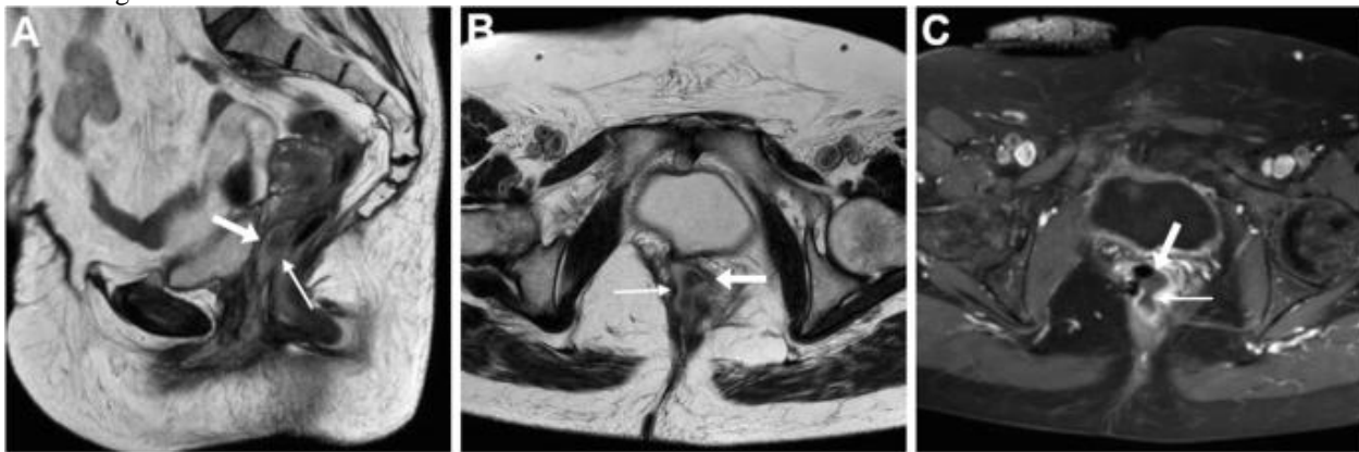
Figure 2 Pelvic and Rectovaginal Fistula on CT, MRI, and MDCT

Moreover, the occurrence of iatrogenic ureteral injury in the course of major gynecological surgeries is reported about 0.5-2.5 per cent with few of them subsequent in fistula development (Iwamuro et al. , 2018). The widely held (88 per cent) of rectovaginal fistula occur due to childbirth pain. A diversity of radiographic and examinations studies have tried to recognize precisely and effectively pelvic fistulae. Intravenous urography, barium enema, cystography, colporrhaphy, and vaginography might demonstrate the existence of appropriate organs in medium, contrast, and outside the region but the fistulous tract commonly fails to identify, partially because several fistulas are small, oblique, and tortuously oriented (VanBuren et al. , 2018). The multidetector computed tomography (MDCT) and computed tomography (CT) reported to be the beneficial techniques in representing a pelvic fistula; but, their drawbacks include intravenous administration contrast and extra processes such as hystero-graphy (Abou-El-Ghar et al. , 2012).