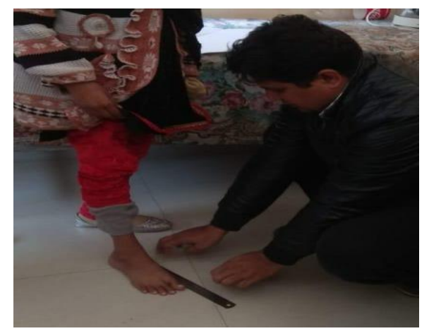
Fig.5 Estimation of foot length