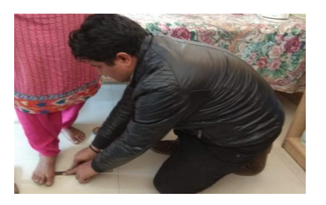
Fig.4 Estimation of foot breadth