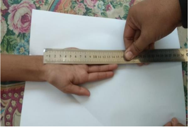
Fig. 2 Hand length estimation of healthy individual