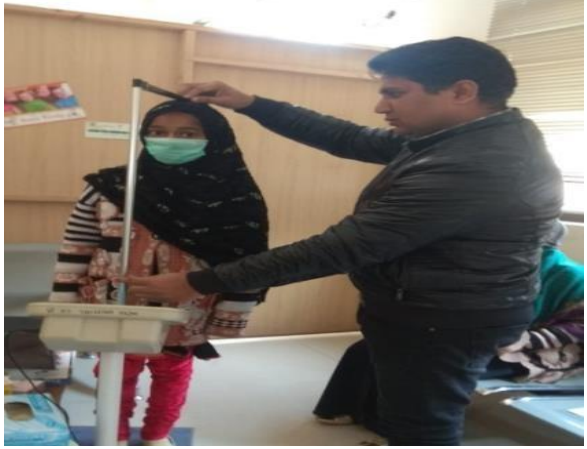
Fig. 1 Stature estimation by Frankfort plane

For the measurement of hand length Fig.2, the distance between the midpoint of distal transverse crease of wrist to most anterior skin projection of middle finger was recorded (Ishak et al. 2012). Hand breadth Fig.3 was reported by measuring the distance between the most metacarpal up to the most medial point on hand of fifth metacarpal (Oshak et al. 2012).