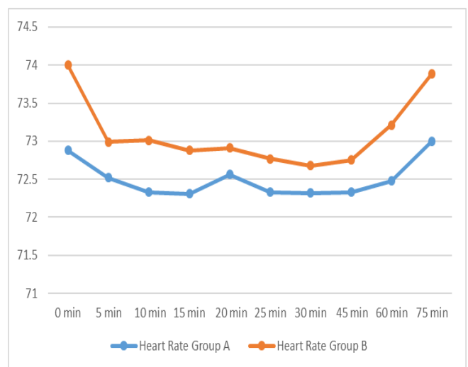
Figure 1 Comparison of heart rates between the groups