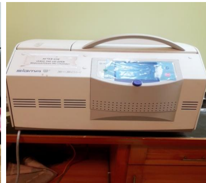
Fig III: showing ethanol treatment and centrifugation of leaves of each variety

seed priming (Ghanbari et al. , 2018). 18 neat and clean pots were chosen. All the pots were filled with soil best suitable for plant growth. Out of 18; three pots were reserved and labeled for each wheat variety. For each variety three pots were reserved i.e. one as control, 2 nd for treatment of solution of 15dS/m NaCl and 3 rd pot for treatment of 10dS/m NaCl. Pots were exposed to ideal condition required for germination. Proper care was taken in watering the pots. Aeration and light intensity was also kept in check and balanced. As seed priming was done so there were chances of even growth of seedling from every pot. After two weeks of germination of seeds; seedling germination data was collected. Healthy plant from each pot was removed very carefully along with its root and cleaned. For each of six variety root length (cm) and plant height (cm) was measured before and after treatment of 10d/S and 15 d/S NaCl. Each variety was morphologically distinct from each other (Kodikara et al. , 2018).