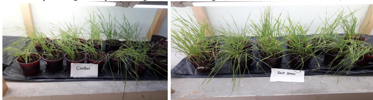
Fig IV: All six varieties with and without salt treatment