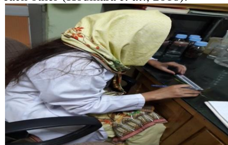
Fig II: Measuring seedling parameters

seed priming (Ghanbari et al. , 2018). 18 neat and clean pots were chosen. All the pots were filled with soil best suitable for plant growth. Out of 18; three pots were reserved and labeled for each wheat variety. For each variety three pots were reserved i.e. one as control, 2 nd for treatment of solution of 15dS/m NaCl and 3 rd pot for treatment of 10dS/m NaCl. Pots were exposed to ideal condition required for germination. Proper care was taken in watering the pots. Aeration and light intensity was also kept in check and balanced. As seed priming was done so there were chances of even growth of seedling from every pot. After two weeks of germination of seeds; seedling germination data was collected. Healthy plant from each pot was removed very carefully along with its root and cleaned. For each of six variety root length (cm) and plant height (cm) was measured before and after treatment of 10d/S and 15 d/S NaCl. Each variety was morphologically distinct from each other (Kodikara et al. , 2018).