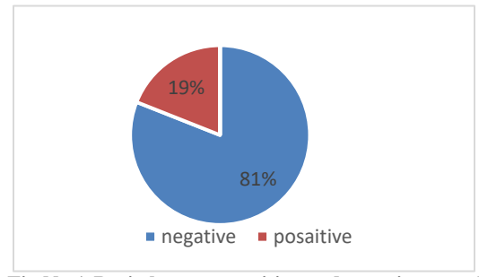
Fig No 1: Ratio between positive and negative sample

Of the 95 positive models, 30 were positive in adults (about 31.5%). The remaining 65 (68.5%) were positive in children under the age of 15 years (Figure 2).