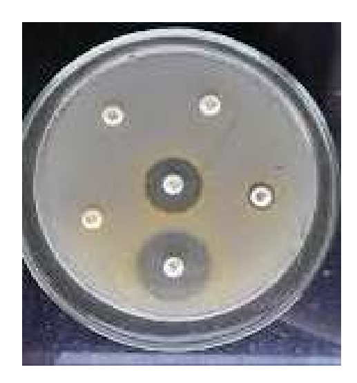
Figure 3: : Antibiotic susceptibility testing

The disk diffusion method was used for the determination of the susceptibility pattern of antibiotics. Metronidazole (MTZ), clarithromycin (CLR), amoxicillin (AML), tetracycline (TET) and ciprofloxacin (CIP) discs were used. To metronidazole (MTZ), maximum number of isolates (69.23%) shows resistance. Resistance to other