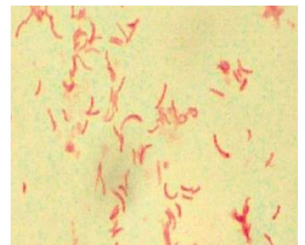
Figure 1: Gram staining of H. pylori

In the present study, a total of 100 patients who visited Mufti Mehmood Memorial Teaching Hospital district Dera Ismail Khan, Khyber Pakhtunkhwa, Pakistan, for upper endoscopy during 2016-2017 were observed for H. pylori . The patients were between 18 and 83 years old. The samples were cultured on Colombia blood agar medium. Gram-negative bacteria with characteristic cell shape and biochemical assays were among the usual criteria used to identify colonies as H. pylori . The results of the biochemical test are given in table 1. An overall prevalence of 52% (52/100) was observed in our study. (Table 2) A high prevalence of H. pylori was observed in males in our study compared to females. Of 45 isolates, 36 (60%) were male while 16 were female (40%). Table 3